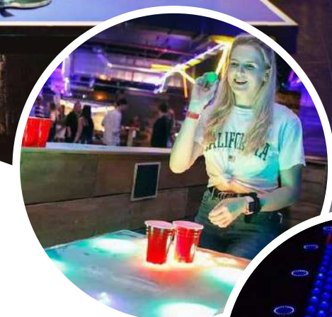
Table tennis is always in trend and continuously excites your visitors. We also offer tables with designs that complement your interior concept visually, going beyond the traditional style.