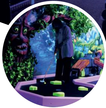
@Jumping Jack, Almere